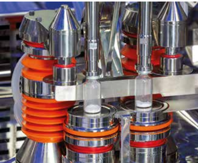
Powder filling line

Development from scratch to commercial manufacturing through IMP (Investigational Medicinal Product) manufacturing